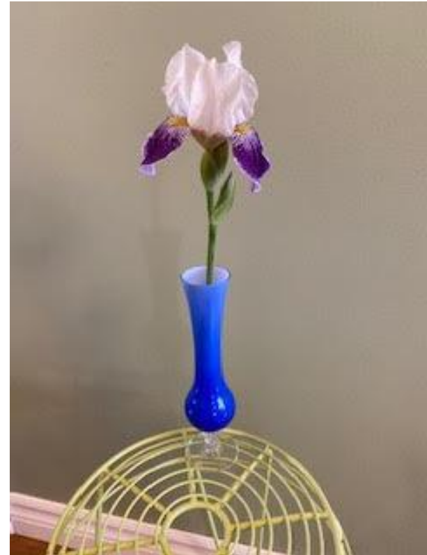
Exhibit could be closer to the camera to give more detail. Good neutral background and lighting.