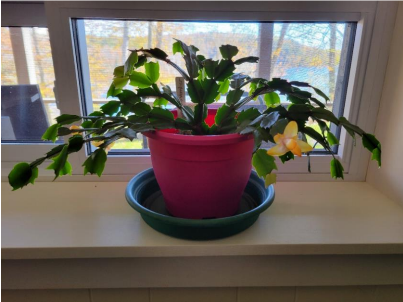
Light source behind the exhibit