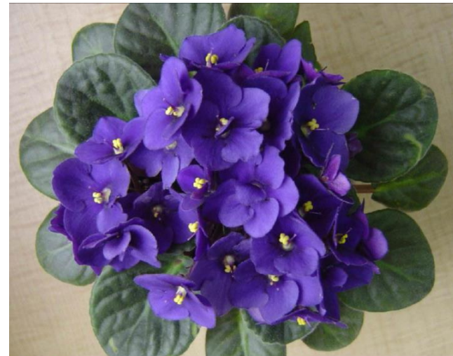
Photo from above, better view

Ensure there are no water spots or dirt on your specimens