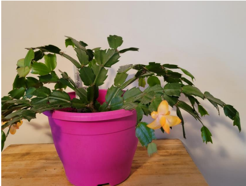
Part of this houseplant has been cut off.

When photographing designs, ensure you get the whole design in the photo. The same applies to houseplants.