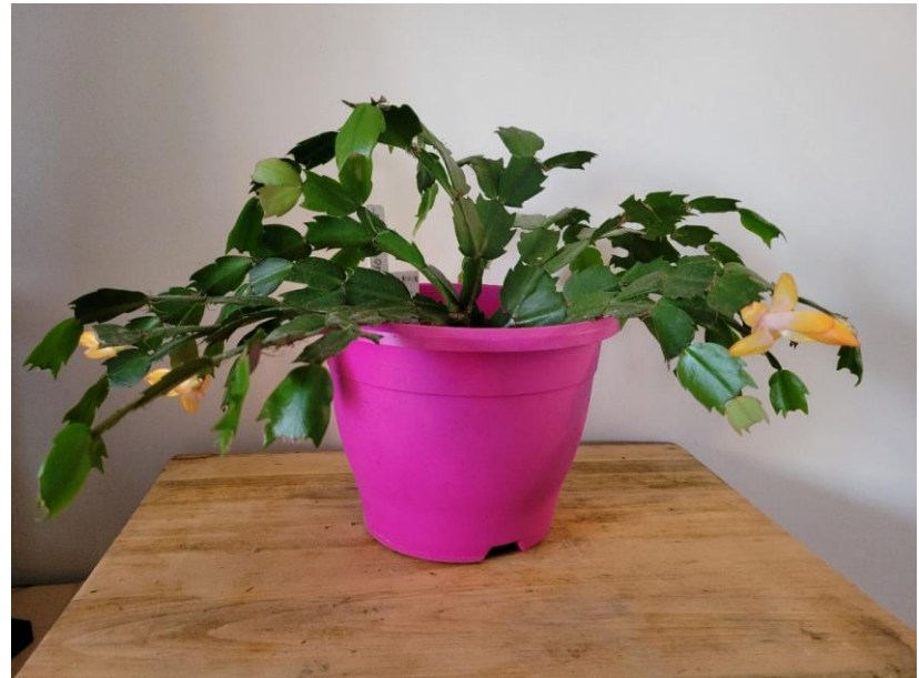
Light source in front of the exhibit

(If you're photographing houseplants, remember to remove any name tags, accessories, and drip trays for the photo and ensure the foliage is clean without bugs, water drops or Plant Shine.)